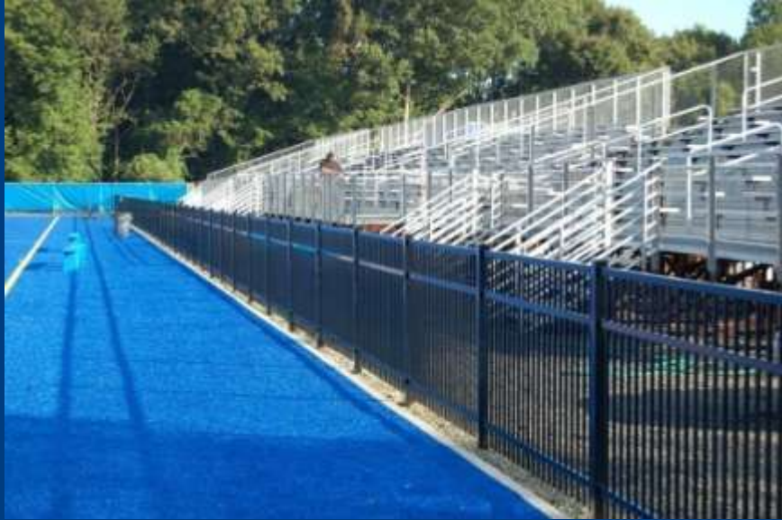
New Field Fence