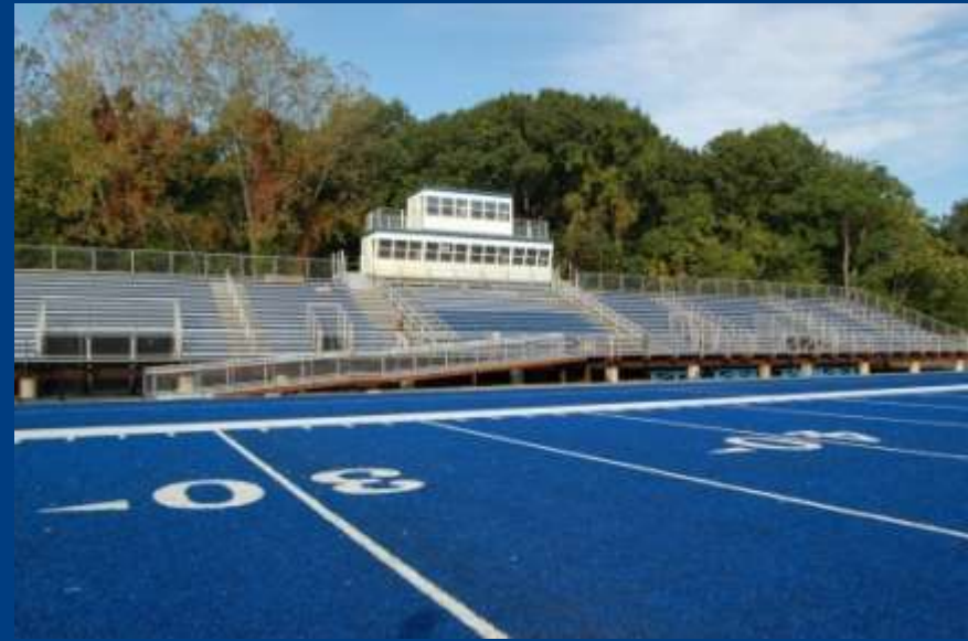
New Press Box