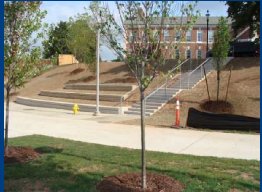
Stairs to Somewhere