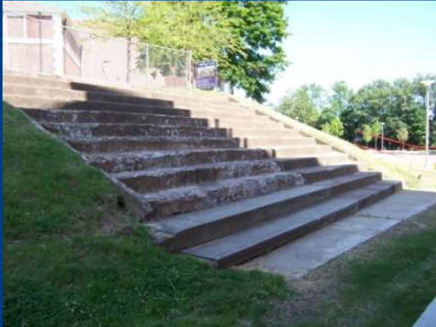
Stairs to Nowhere